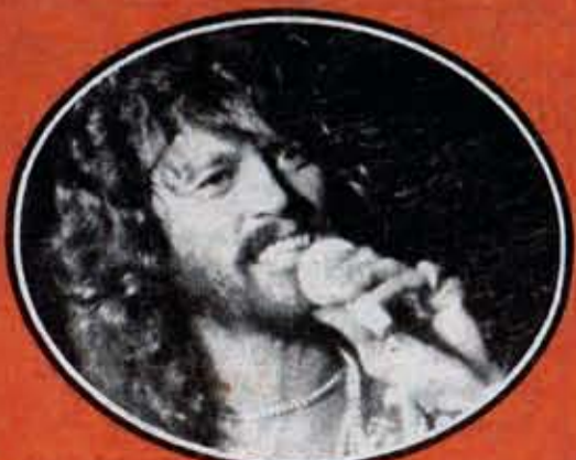
The Bee Gees